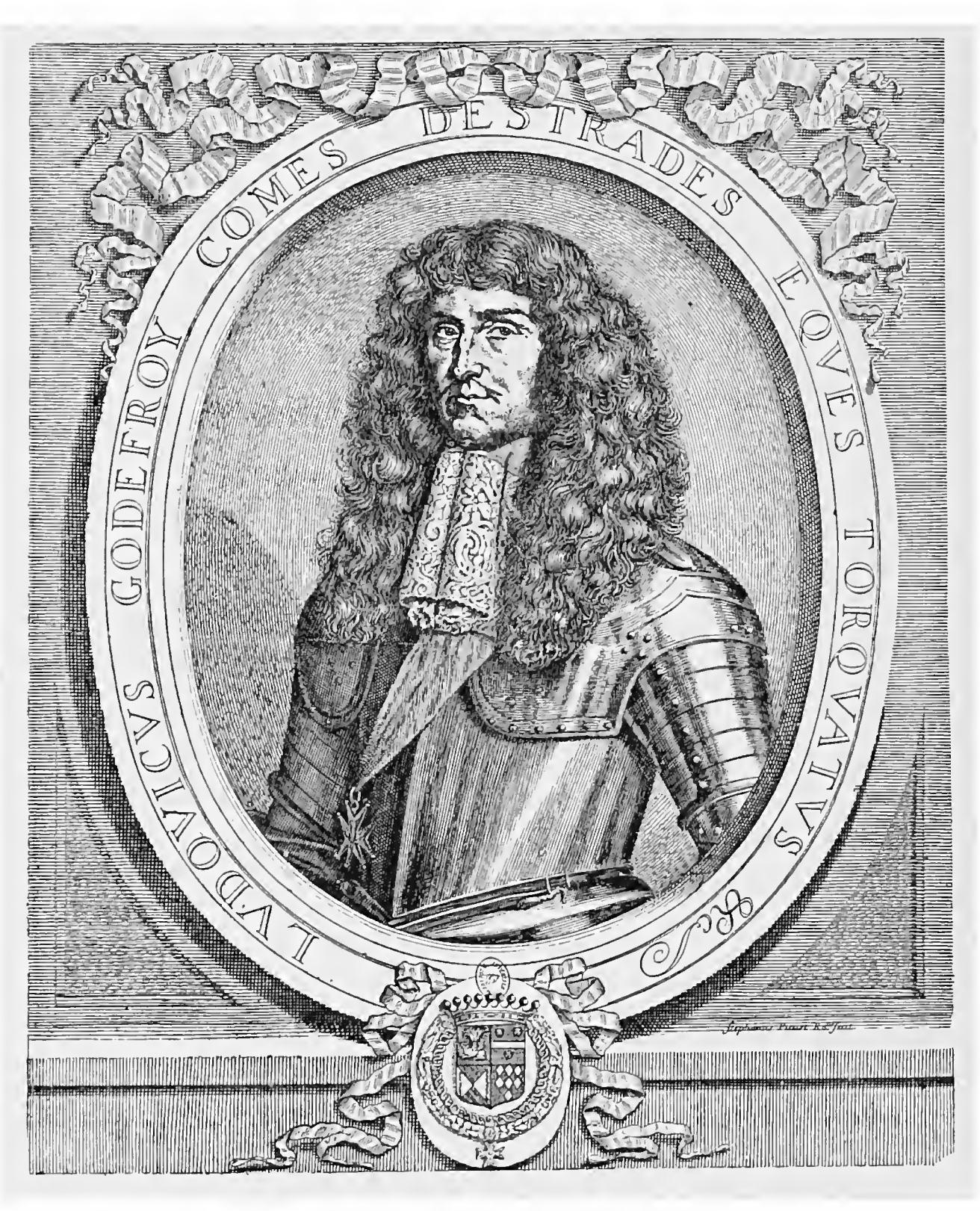
LE COMTE D'ESTRADES Ambassador to England 1661